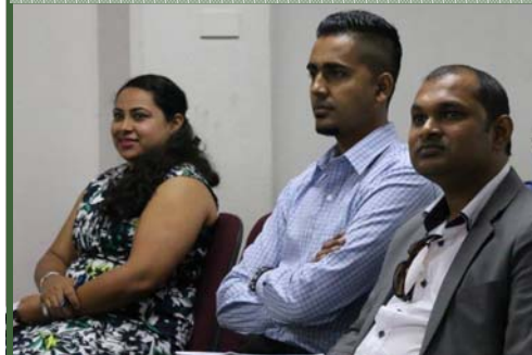
UNDP & National Planning representatives