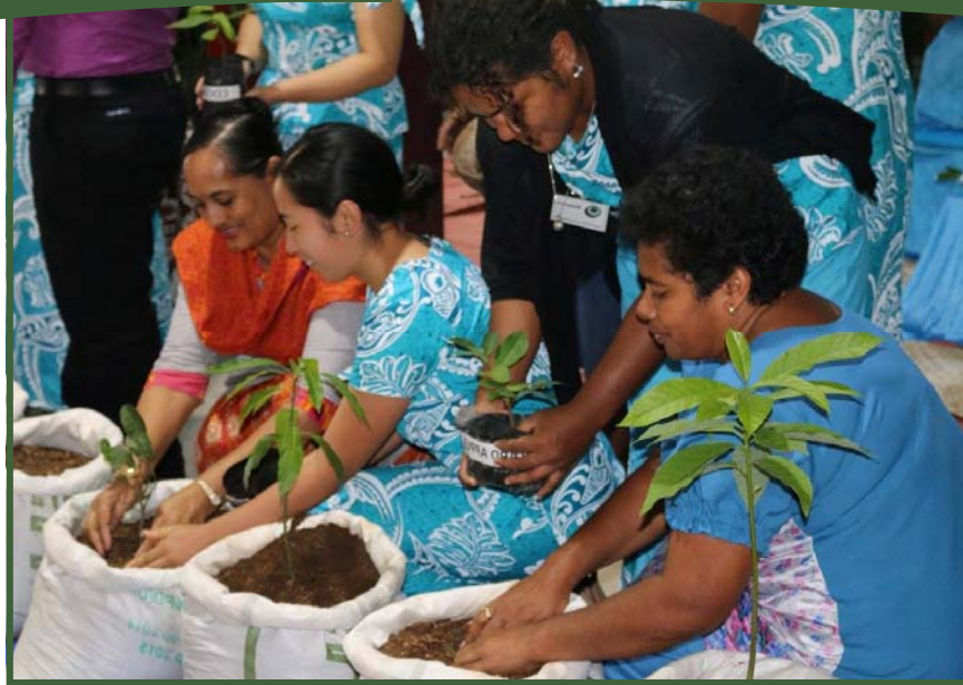
Staff assist guests in fruit tree planting