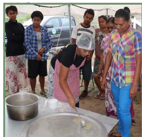
Poppadom making demonstration