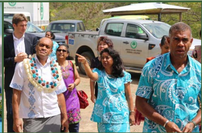
A tour of the premises A blast from the past