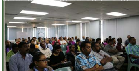
A full house