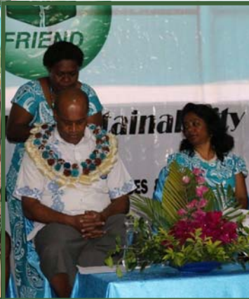
Garlanding the Chief Guest—Minister for Health Hon Jone Usamate