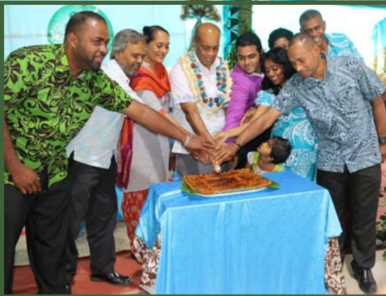
Stakeholders join in cutting cake

"While we have come a fair distance, there is still so much more to be done," says Sashi, "for now, it's a step at a time."