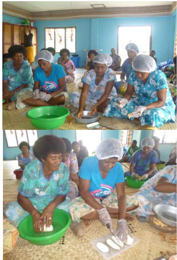
Chopping and dicing fruits and root crops for drying