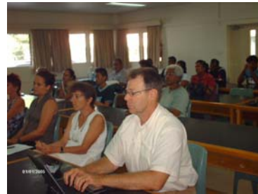
Suva participants of the public lecture on Community Leadership