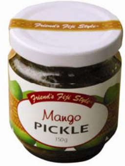
have more flesh on the pickle to

So, after many more months of trials and testing, Friend's Fiji Style is now ready to present to you its improved Mango Pickle. A perfect accompaniment to your meals. Get one today!