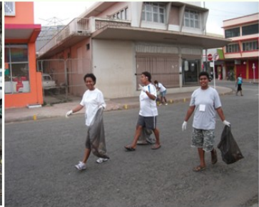
Diwali photos 09