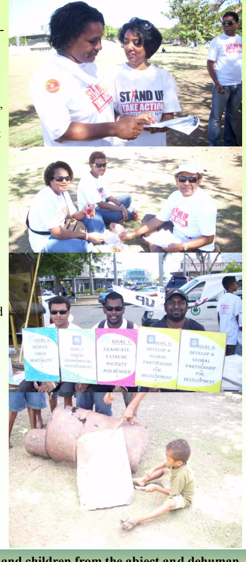
A total of 1328 events in 74 Countries. We will spare no effort to free our fellow men, women and children from the abject and dehumanizing conditions of extreme poverty, to which more than a billion of them are currently subjected. -- Millennium Declaration

According to Paths to 2015 – MDG priorities in Asia and the Pacific, jointly produced by the UN Economic and Social Commission for Asia and the Pacific the UN Development Programme and the Asian Development Bank, the number of people in the region living on less than $1.25 a day has dropped from 1.5 billion in 1990 to just under 950 million in 2005, helping to drive global success in cutting poverty.