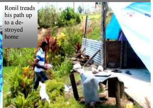
Ronil treads his path up to a destroyed home