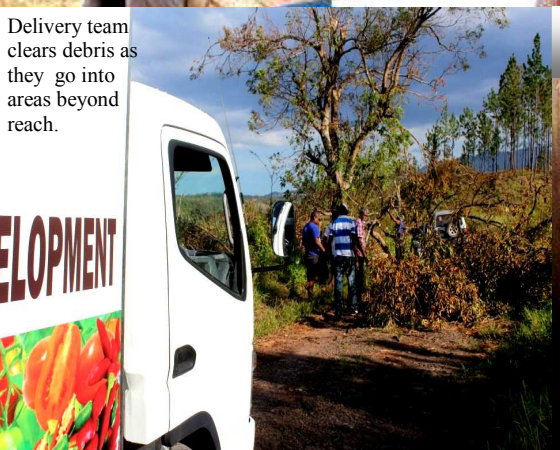
Delivery team clears debris as they go into areas beyond reach.