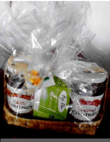
2 Jars & a box of Teabags

Thank you for your efforts in our poverty alleviation initiative.